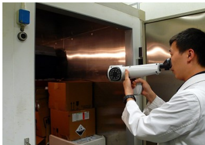
現場氣味測試 (On-site Odour Testing)