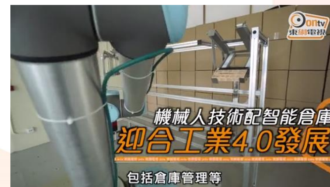
Media exposure as Industry 4.0 showcase