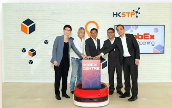
Demonstrated robot technology, facial recognition and big-data analysis at the first unmanned warehouse at Science Park