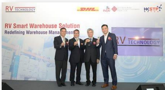
Established anchor customer with DHL Supply Chain